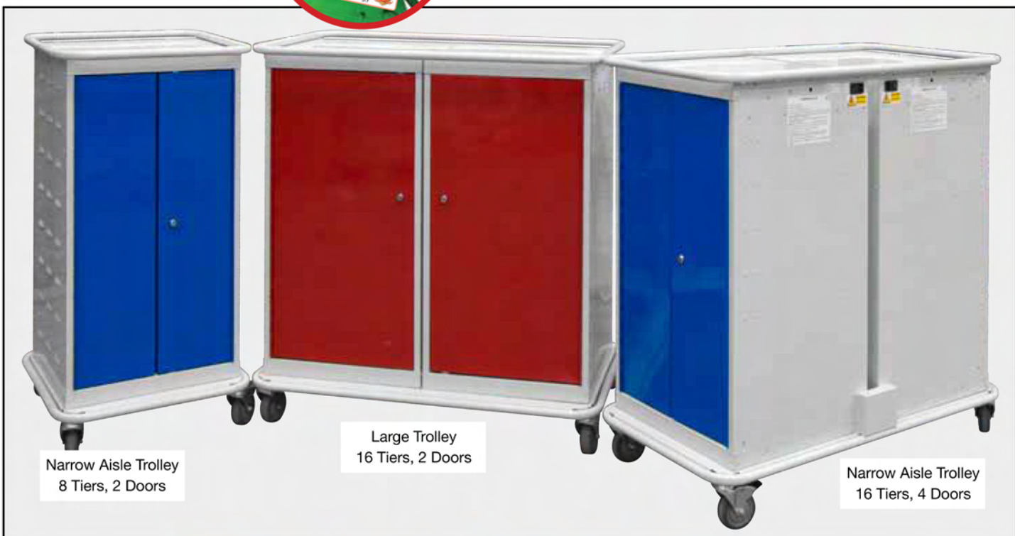
Narrow Aisle Trolley 8 Tiers, 2 Doors